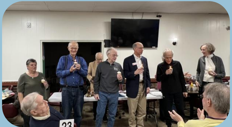
Celebrating members birthdays in March