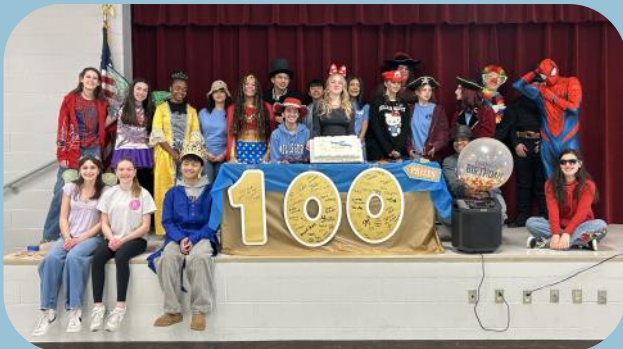
These two pictures were chosen by the Capital District to be a part of their presentation at DCON.